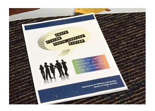
✤ For more youth voice, see DCF's <u>"Youth</u> <u>Vision for the Youth Justice System</u>" report.

"Giving someone a punishment without asking why doesn't help. It takes literally two seconds to ask someone the word 'why?' Understanding why something happened will help more than punishing."